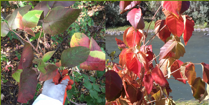
Eastern Poison Ivy

Poison ivy's fall colors are in full swing in many parts of the county. Poison ivy is usually one of the very first plants to have its leaves change color in the fall. You'll look out into the woods and everything will be green, except for the bright yellow, orange, or red leaves on a poison ivy vine or shrub.